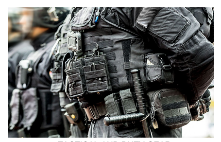
TACTICAL AND DUTY GEAR