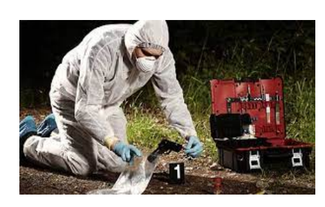
FORENSICS AND CIS EQUIPMENT