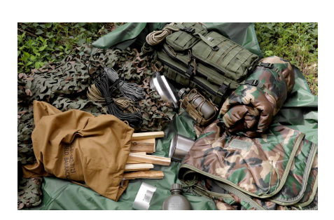
SURVIVAL AND OUTDOOR EQUIPMENT