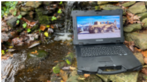
RUGGED LAPTOPS AND TABLETS