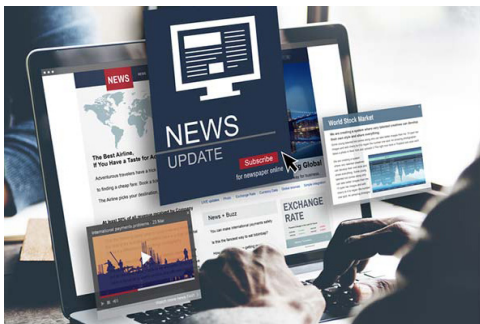
MEDIA MONITORING SOFTWARE