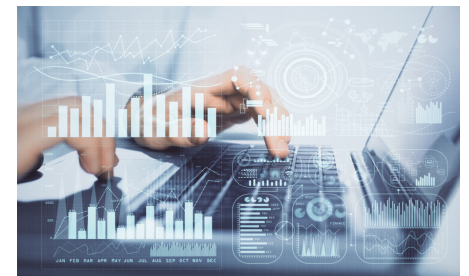
REAL-TIME ACTIONABLE INTELLIGENCE