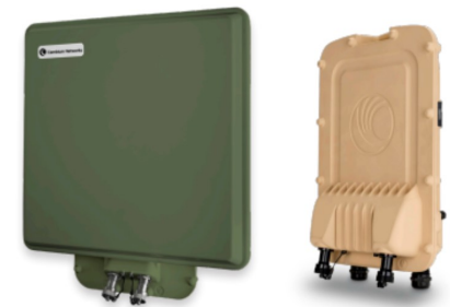
MICROWAVE LOS RADIOS