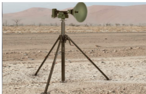
RAPID DEPLOYMENT KIT